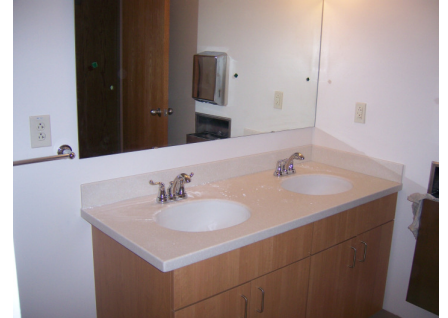
Interfaith Hospitality Network Hotel